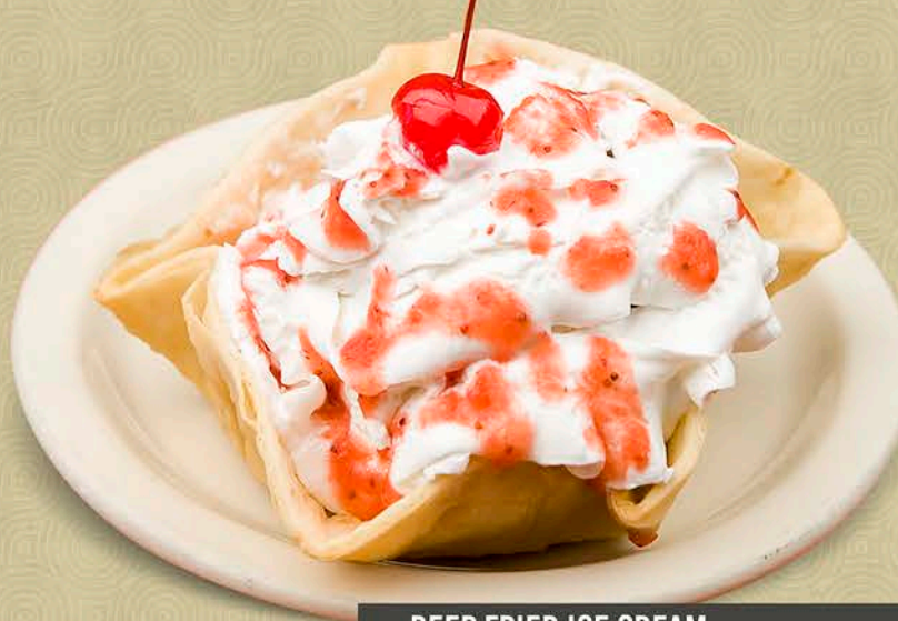
DEEP FRIED ICE CREAM

A delicious pork meat marinated with cilantro, tomato, onions and spices. Served with pinto beans, rice and pico de gallo over very mild salsa.